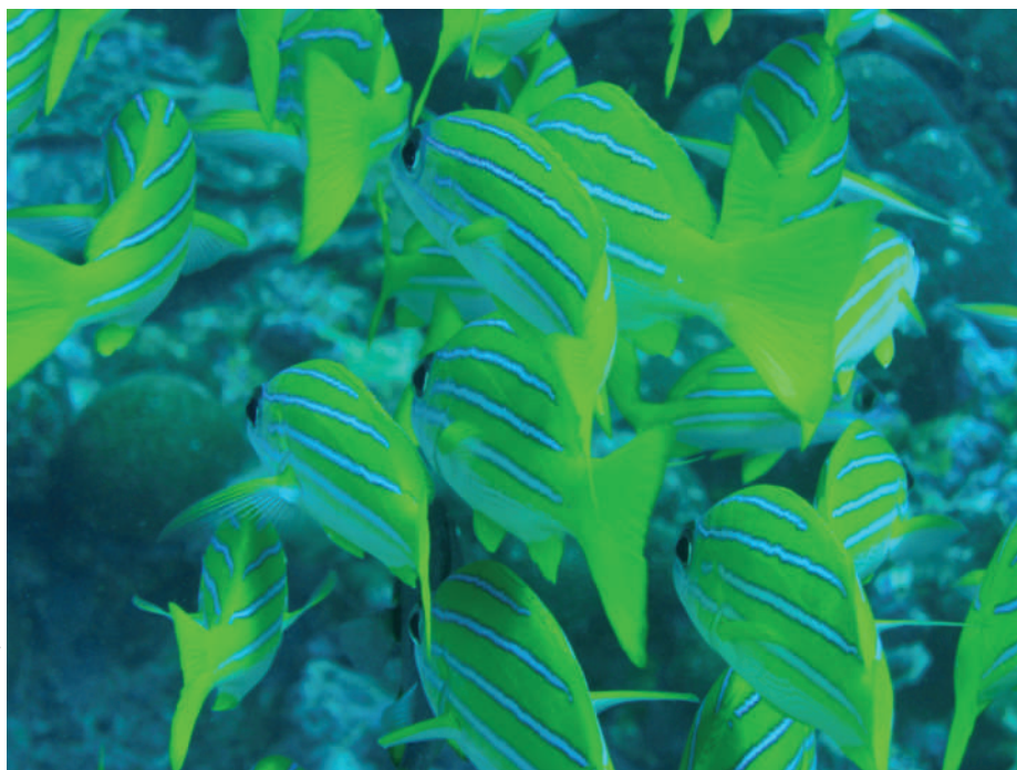
Figure 2 | Bluestriped snapper, Lutjanus casmira , is a typical reef fish photographed here on Christmas Island in the central Pacific Ocean.

were run centrally. The same holds for census projects in different contexts, from the Domesday Book, a census of land, livestock and possessions in eleventh-century England ordered by William the Conqueror, to the US census, run by the US Census Bureau. Attempting a population census bottom-up would probably yield something like the number of jazz musicians in New Orleans, lumberjacks in Oregon and financial analysts in New York City, but no countrywide population estimate.